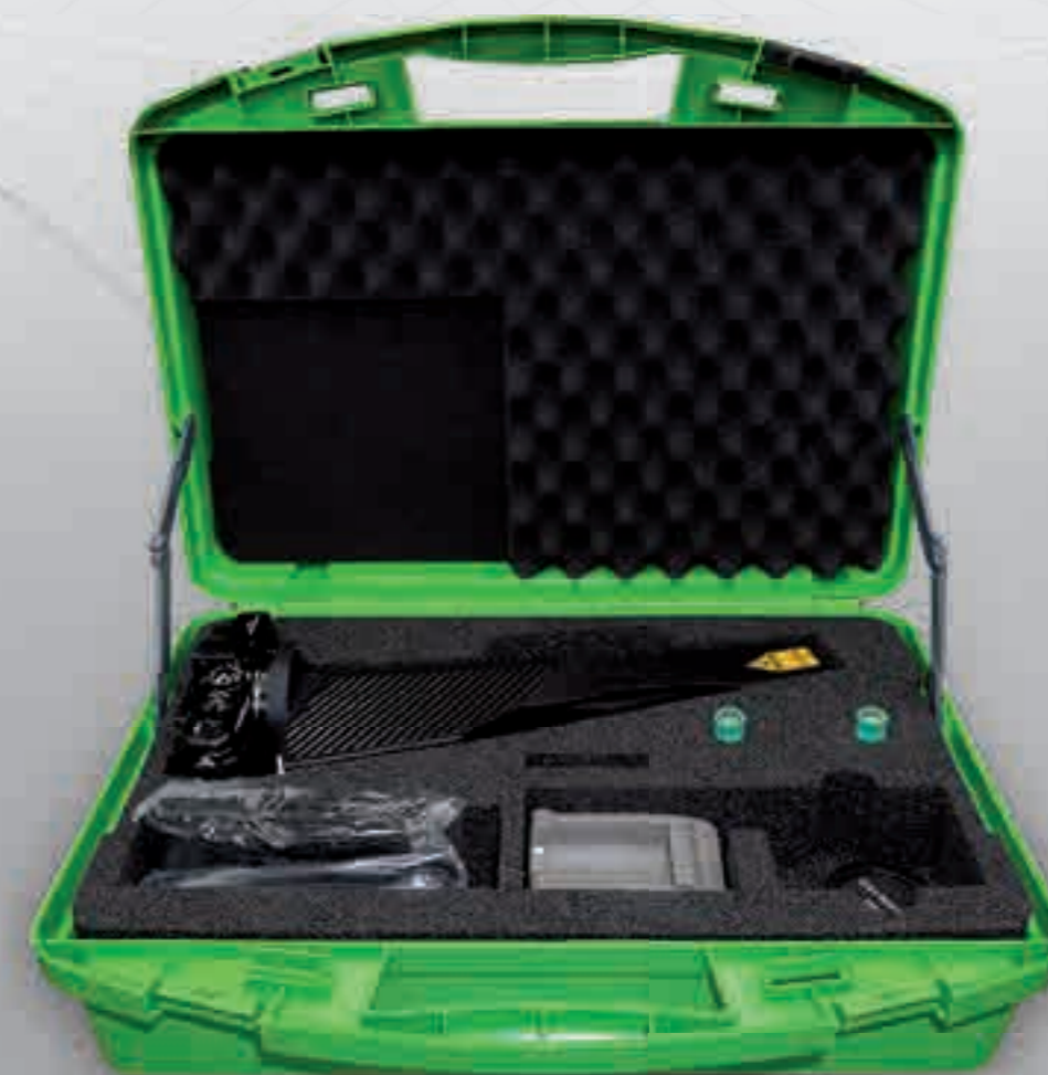
Figure: Device case with STT shaft twist tester NK

The disturbed periodicity leads to a non continuous stripe pattern. Above a period length of 200 \mu m the spacing between the diffraction lines is very small and it is difficult to resolve it with human eye. The pictures recorded by the video camera are magnified by a factor 4 and displayed on a screen. That leads to a clearly improved resolution of long wave twist structures (200 \mu m - 500 \mu m). The STT R100 NV is principally designed for the stationary 100%-inspection of seal seat surfaces close to the manufacturing process and is connected to a video camera and a screen. The Video camera can also be readout by a PC via a standard TV tuner card. The disturbed diffraction lines pattern can be compacted to standing lines, while rotating the shaft between centres or in the lathe chuck, which indicates the presence of twist.