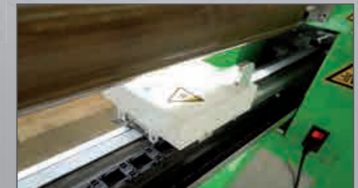
Picture: m-cat measuring slide