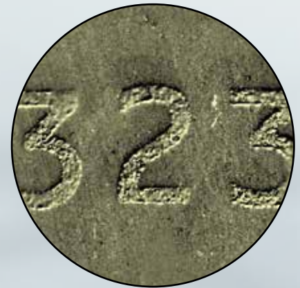
Visualization of the magnetic structure of a serial number